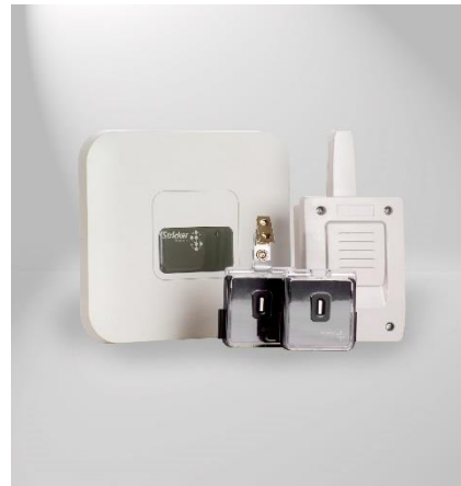
Example of RFID with hand held remote control