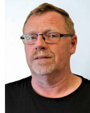
Sales and Technical Support Mobil: +45 52395986 jc@myporte.dk