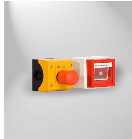
Example of Emergency open button