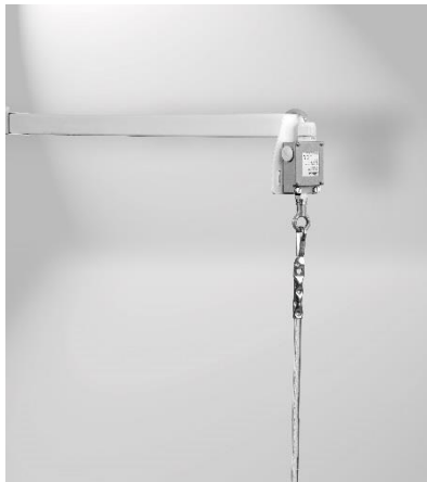
Example of pull switch with extension arm