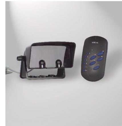
Example of radar detector